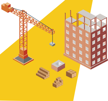
BUILDING & CONSTRUCTION