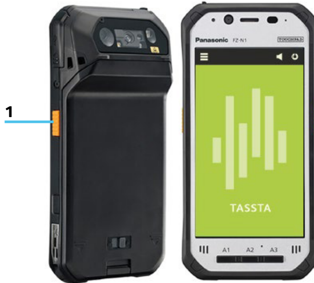
1. PTT button

The Toughpad FZ-N1 with Android™ 6.0 is one of the thinnest and most lightweight handheld tablets in the 4.7” category. The device offers numerous unique features, including an angled rear barcode reader which protects users from repetitive strain and enhances productivity, and an optional passive and active pen for precise handwriting and signature capture.