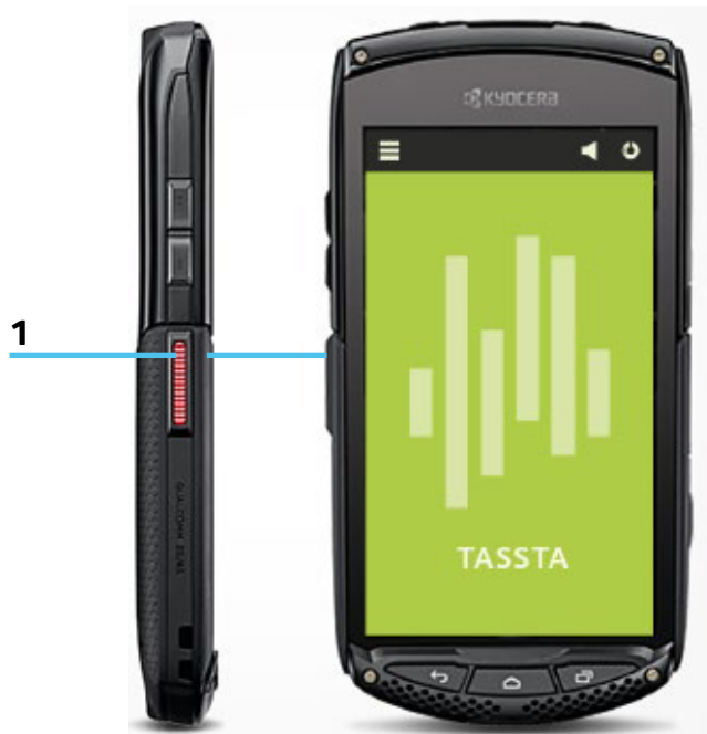
1. Side PTT button

It's ultra-durable with Military Standard 810G protection against dust, shock, vibration, temperature extremes, blowing rain, low pressure, solar radiation, salt fog, humidity, and water immersion making it an ideal sidekick for just about any adventure.