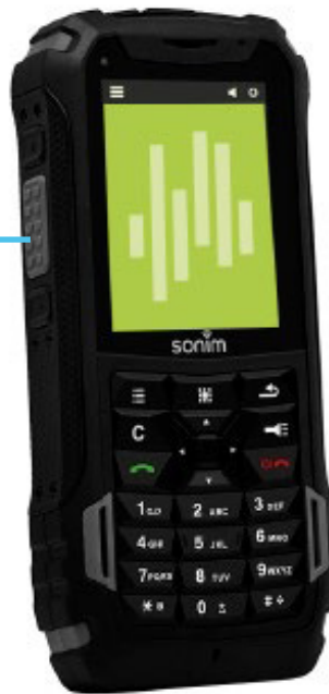
1. Side PTT button

The Sonim XP5 is an ultra-rugged LTE, Push-to-Talk phone with WiFi capabilities, powerful audio and long lasting battery, allowing field workers to more efficiently communicate with their teams.