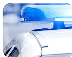
PUBLIC OR PRIVATE SECURITY COMPANIES