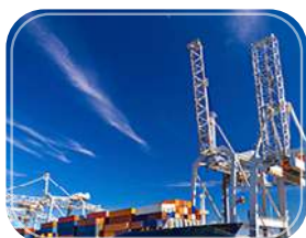
NAVIGATION, FREIGHT & PORTS