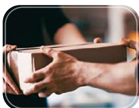
COURIERS & EXPRESS SERVICES