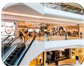
CAMPUS & SHOPPING CENTERS