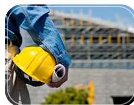
BUILDING & CONSTRUCTION